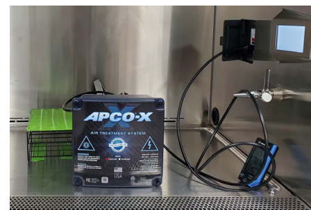
APCO-X™ in test chamber

Since the onset of the COVID-19 pandemic, Platinum Air Care has been providing UV system recommendations for residential, educational and healthcare facilities. Platinum PCO UV systems were also used in the FDA sponsored testing of UVC's ability to disinfect and extend the life of N95 masks as published in the American Journal of Infection Control. With the latest SARS-CoV-2 phase 1 test, Fresh-Aire UV now has validation as a global provider of germicidal UV systems for air and surface disinfection.